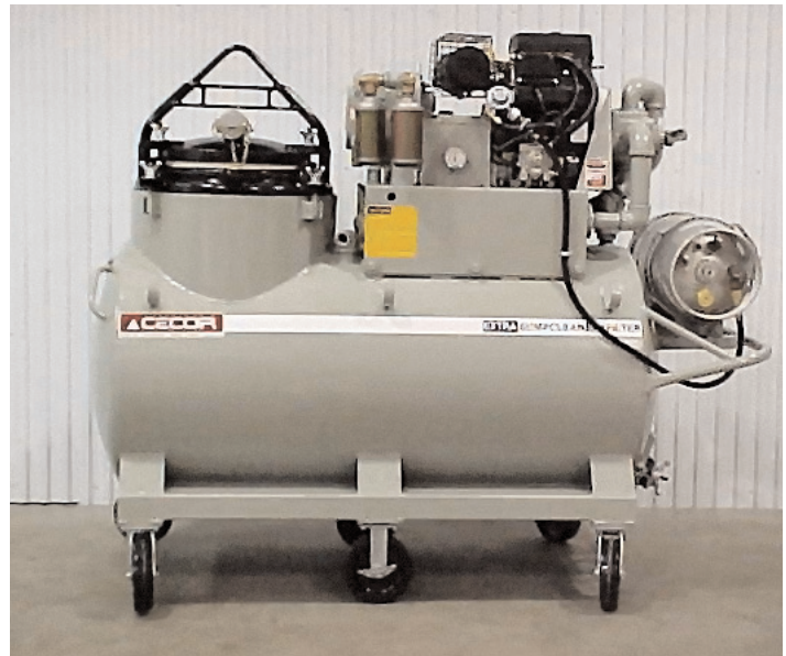
SP50-175PL6 Extra Power Propane Sumpcleaner/Filter.

Tank Size: 175, 300, 400, 500 and 600 gallon capacity. Engine: 20 HP Propane Engine. Pump: Lobe Type, Positive Displacement air pump. Suction Lift: 13" Hg (Mercury) or 177" water. Filter: F50 Filter has 5 cubic feet capacity. Can hold up to 800 lbs. Features built-in lifting bail, anti-bridging reverse tapered sides and patented positive locking latch. Filter Sleeve: Available in regular and fine polypropylene sleeves.