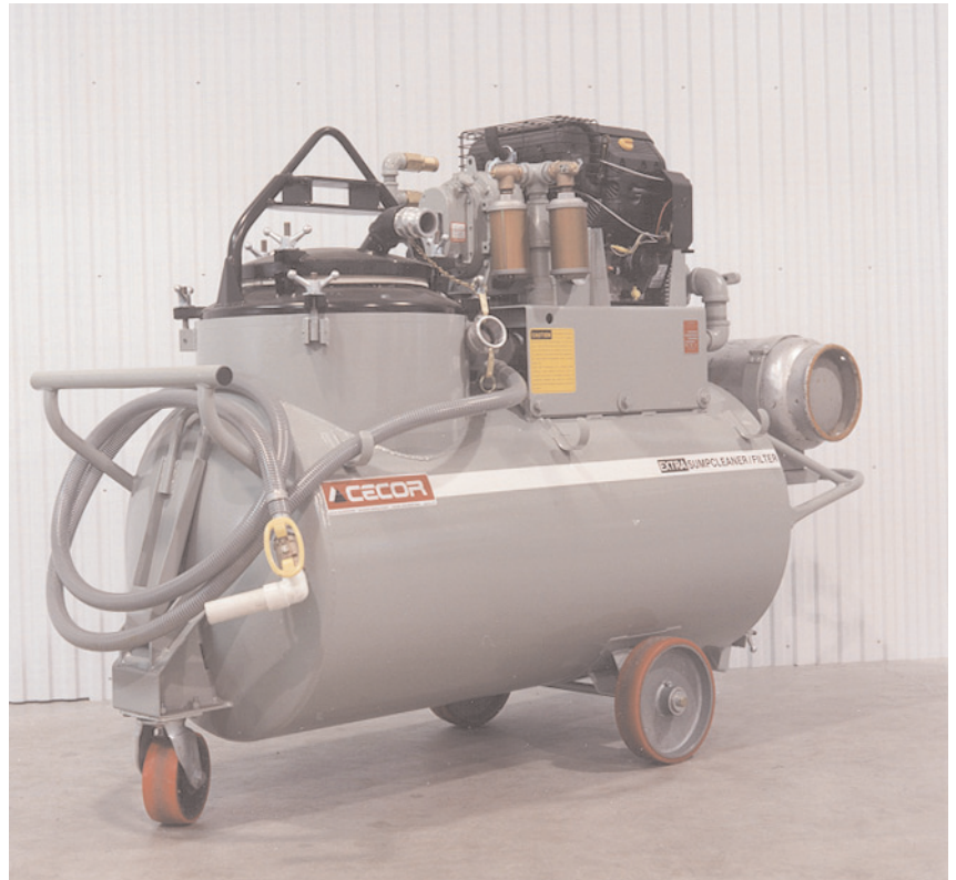
SP50-175PT Extra Power Propane Sumpcleaner/Filter.

The Extra Power unit is also available as a Combination Sumpcleaner/ Filter. and Coolant Dispenser.